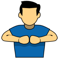
4. Contest "Contest"

Raise both arms, fully extended, straight up, palms facing inward