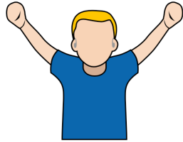
2. Violation "Violation"

Hold one arm straight out and chop the other forearm across the straight arm