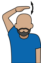
14. Timing Violation "Stall" "Violation"

Right arm extended in front of body, palm facing up and then rotate to palm facing down