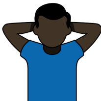
19. Personnel Ratio: Male Matching

Hands clasped and raised above head, arms bent