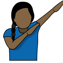
24. Match Point "Match Point"

Open hand held above head and sweeping forward and back