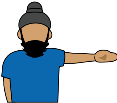
7. In/Out-of-bounds – Out of end zone "In" "Out"

Sweeping crossover motion with both arms extended down in front of body