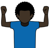
10. Pick "Pick"

Elbow down forearm vertical index finger pointing upward