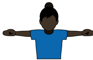
12. Marking Infraction "Fast Count" "Straddle" "Disc Space" "Wrapping" "Double Team" "Vision"

Closed fists, rotate wrists around in a vertical circle