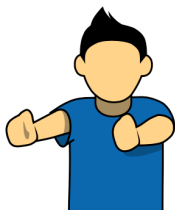
22. Who made the call "Called by Offence/Defence"

Wave both extended arms crosswise overhead