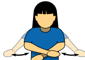
6. Retracted "Retracted"

Forearms extended in front of body, elbows tight against torso with palms facing upwards