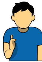
9. Disc up

Index finger straight arm pointing down at 45 degree