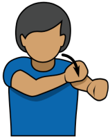
1. Foul "Foul"

Hold one arm straight out and chop the other forearm across the straight arm