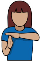
16. Time-out "Time-out"

Form a T with the hands, or a hand and the disc