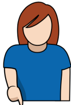
8. Disc down

Point with one arm extended, flat palm, thumb parallel to fingers, towards playing field (in) or away from playing field (out)