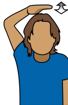
23. Did not affect the play "Did not affect the play"

Pointing with two arms straight out, towards the end zone being defended by the team