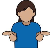
5. Accepted "Accepted"

Two fists bumped together in front of chest, back of hands facing outward