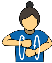
11. Travel "Travel"

Arms raised, elbows bent, fists facing head